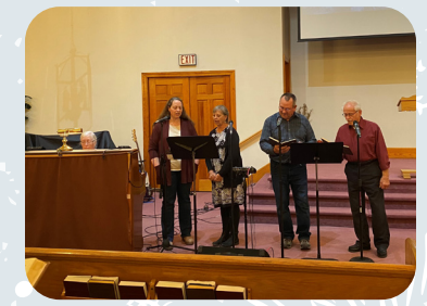
Revival meetings, Allensville Mennonite, PA