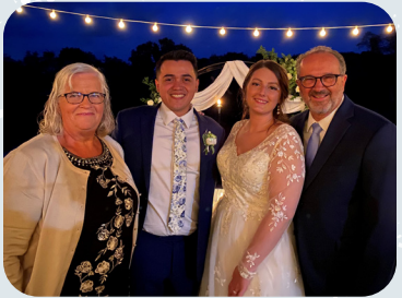
Wedding in Ohio