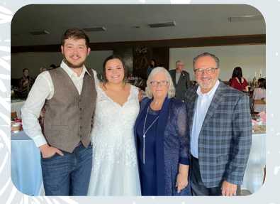
Wedding in Indiana