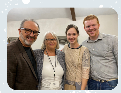
Phil and Elsie met this young couple at Pastors Conference in Iowa.