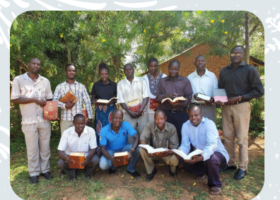
Bible distribution, Kenya