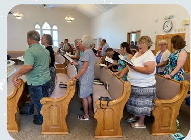
Overseer visit, Johnsville Mennonite, OH