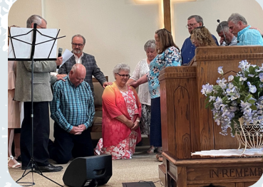
Ordination, Zion Mennonite, OK